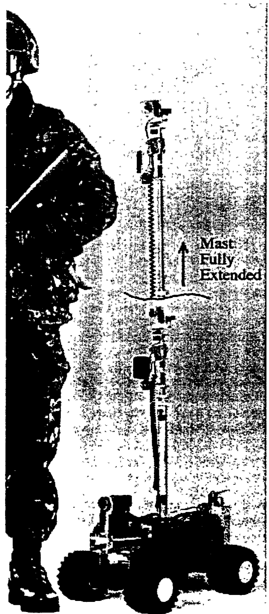
Figure 1 The miniature surveillance vehicle showing its telescoping mast in its collapsed and extended positions.