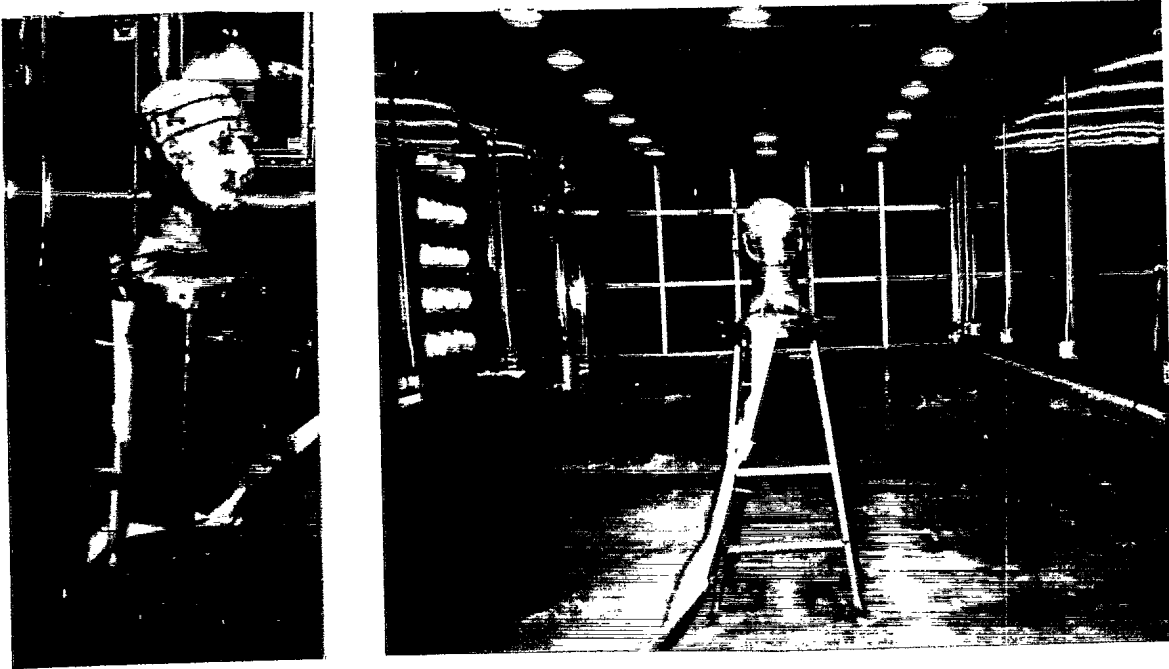
Figure 1. Two views of the three-zone thermal manikin head in the DCIEM wind tunnel.

The chamber refrigeration system was not used. Air temperature varied from day to day, but changed very little during measurement runs because of the chamber's large heat capacity. To avoid heating the room or the thermal manikin head, the lights were not turned on. When the large motor of the wind turbine was running at high speed, the air temperature drifted slowly upward at a rate of a few tenths of a degree C per hour. However, the thermal manikin head responded very quickly by comparison so a good approximation of steady state could be obtained.