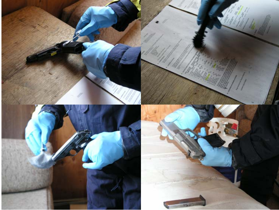
Figure 3: Forensic collection and analysis performed in the crime scene

Fingerprinting of evidence was performed by dusting with powder. Documents at the scene were the first items to be examined for fingerprints. Documents with prints were double bagged and checked for contamination. Documents without prints were photographed for further analysis at a forensic laboratory.