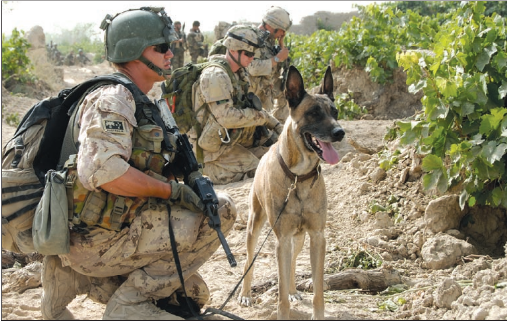
Joint operations with Australian forces during Operation Timis Pream , 21 August 2008.

operations and permit the development of a single COA based on intuition and experience. The result is a less-cumbersome, faster, and more responsive and adaptable method that nurtures a greater appreciation and understanding by the planners of the problem-space.