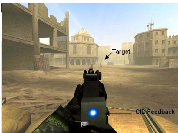
Figure 1. Participant's view in simulation

The experimental simulation was modified from a commercial shooter game. Figure 1 shows a screenshot of the participants' view. This simulation was installed on two Dell OptiPlex GX270 desktop computers with 20-in UltraSharp 2000FP flat panel monitors. For each participant, only one computer and one monitor were used.