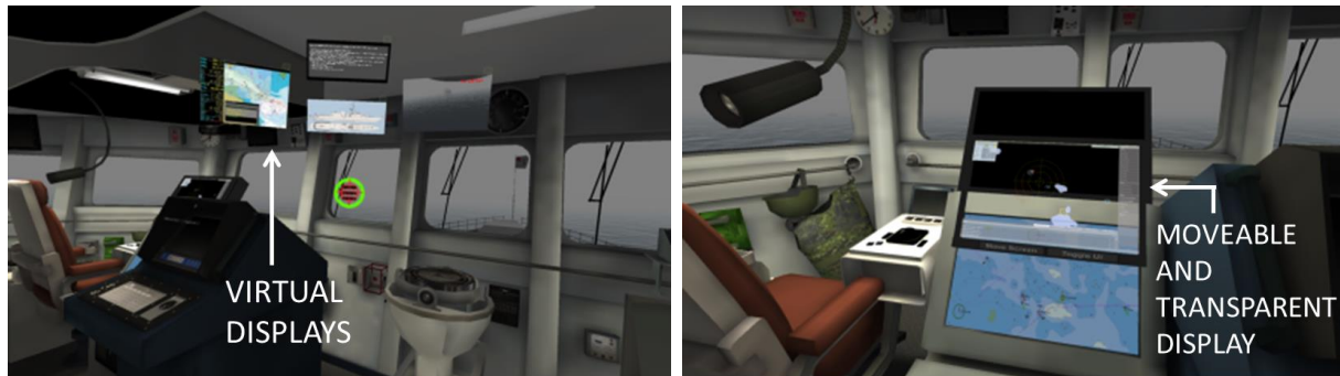
Fig. 4. Virtual Displays & Transparent (Overlaid) Display Content

lated systems can be adjusted to suit the user's needs (i.e. personalized), which may have the effect of improving accuracy and reaction time during a variety of tasks when making use of the information that the systems offer (though research must be completed to assess this hypothesis in this context).