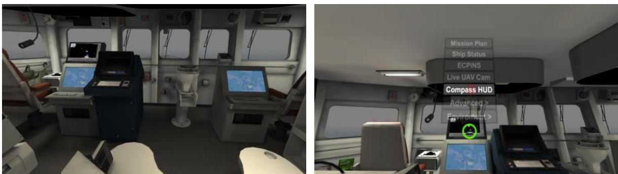
Fig. 2. Overview of VR Bridge Environment & AR Menu System

Five of the use-cases that we developed are described below (refer to Fig. 2. and Fig. 3.), in order to provide readers with a sense of what SMEs positively responded to in terms of the use of AR in operational settings: