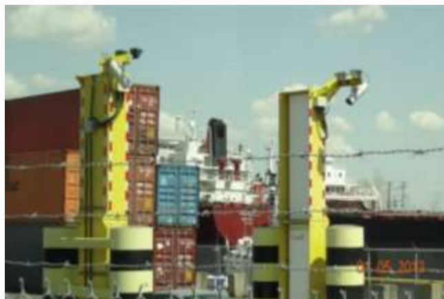
Figure 1: Radiation Detection Portal [4].

Radiation detection equipment is located at Marine Ports in order to prevent dangerous goods from entering the country. Radiation detection portals (illustrated in Figure 1), which are the primary scanning devices, are used to non-intrusively scan all shipping containers arriving at Canadian marine ports. Any shipping containers with an elevated reading, above normal background levels, generate an alarm and undergo a risk assessment and further radiation examination to determine the cause and extent of the radiation. This is done at the National Targeting Centre (NTC). It is worth mentioning that less than 1% of containers trigger an alarm, and, of this 1%, 80% will be cleared quickly as the radiation is naturally occurring. The remaining alarms require a more detailed secondary scan. A secondary scan typically relies on a carborne unit or a Heiman Cargo Vision Mobile (HCVM) / Vehicle and Cargo Inspection System (VACIS) unit. As the name implies, a carborne unit is one in which the radiation monitoring system is affixed to the roof of a vehicle. Both HCVM/VACIS units are mobile scanners.