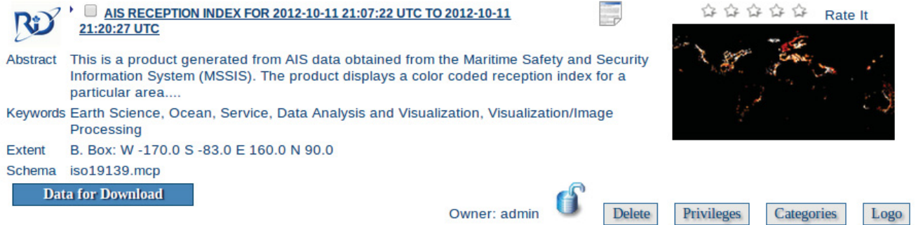
Figure 1: Screen capture of the AIS Indexer's product as it appears in GeoNetwork.