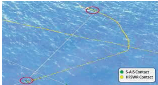
Figure 5: Vessel manoeuvre recorded by the High Frequency Surface Wave Radar track but missed by space intercepted AIS due to infrequency of reports. (AIS contacts are within the red circles.)

and Tracking (LRIT) system was established in 2006 by the International Maritime Organization (IMO). LRIT regulations apply to ships engaged on international voyages and require that these vessels automatically report their position to their flag administration at least four times per day. Other contracting governments may request information about vessels in which they have a legitimate interest.