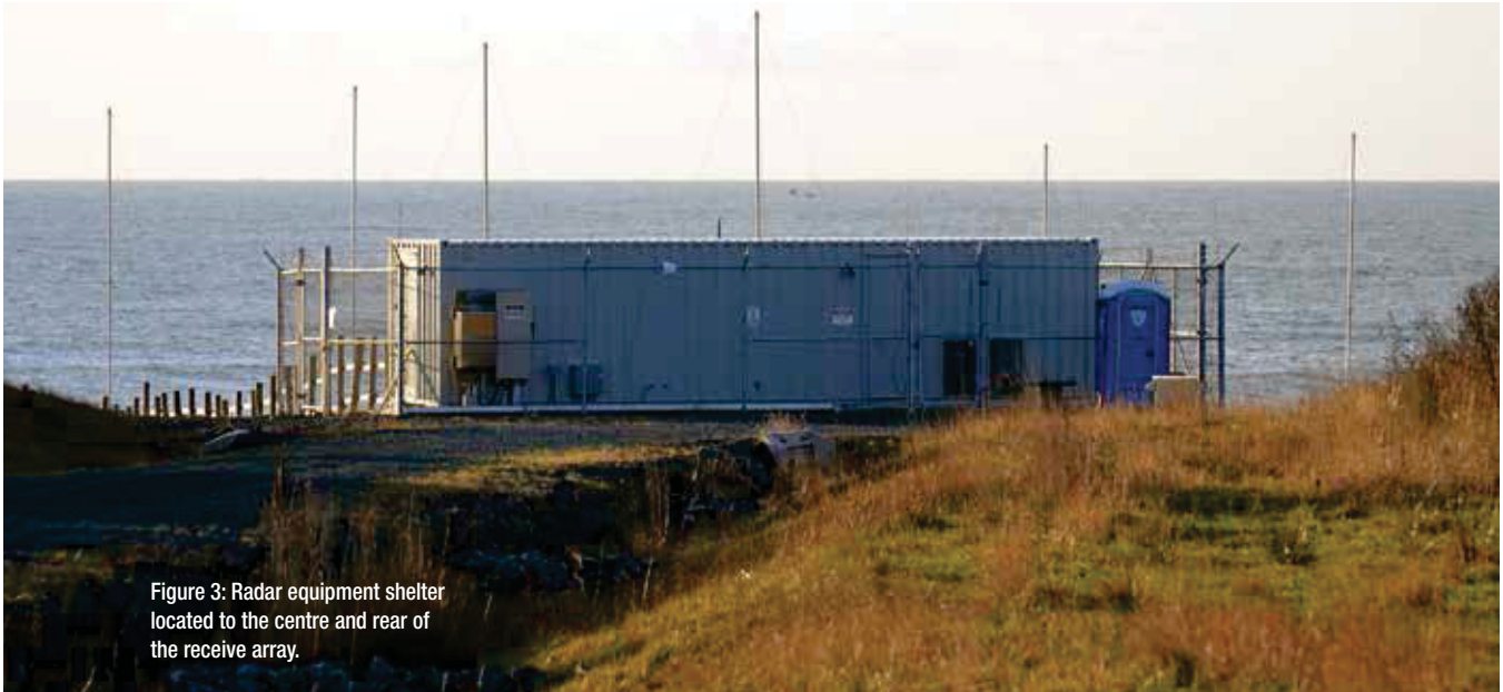
Figure 3: Radar equipment shelter located to the centre and rear of the receive array.

also be used to maintain performance while reducing the physical aperture of the radar.