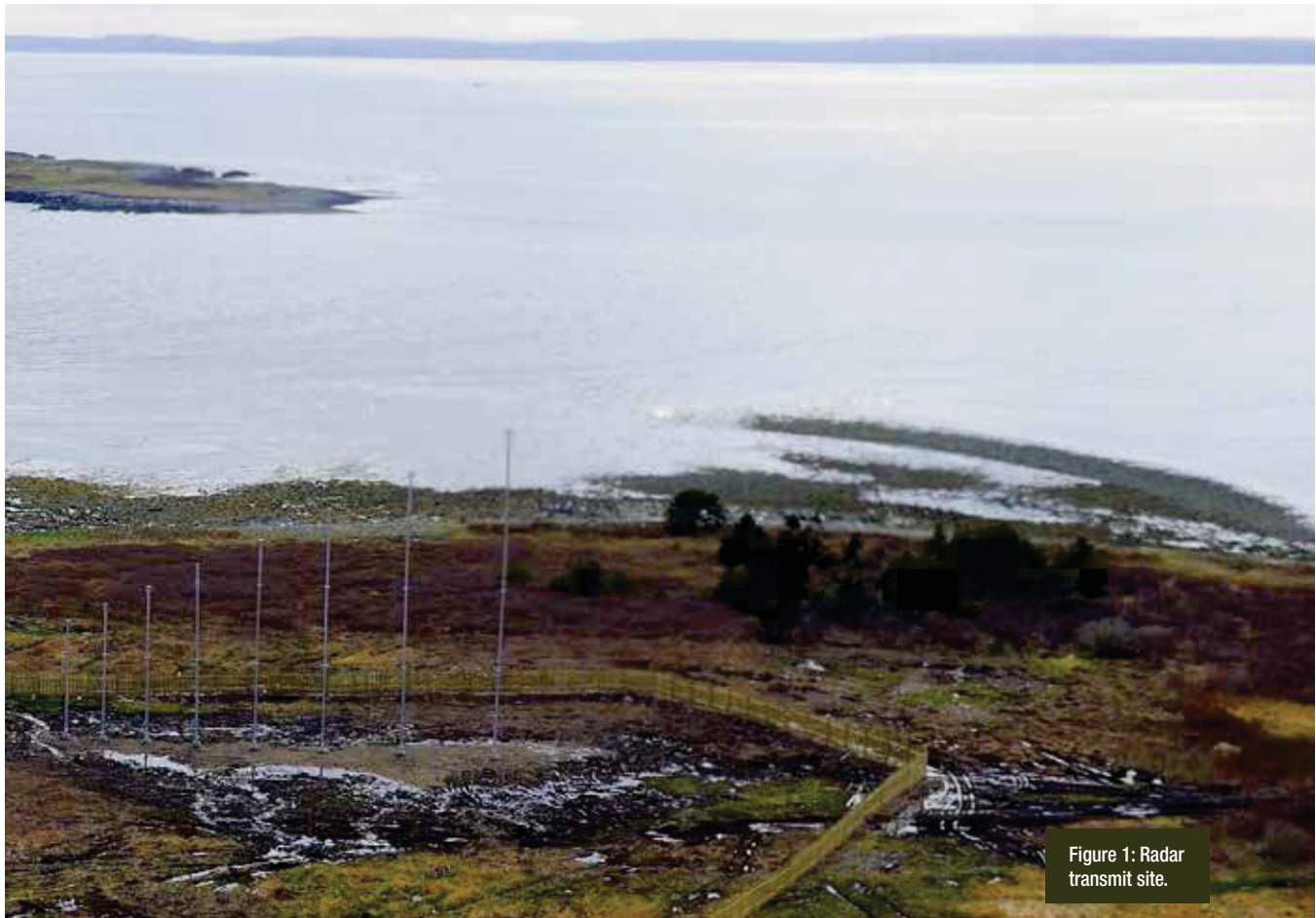
Figure 1: Radar transmit site.

surveillance based on a combination of cost and performance. At the same time, RCL started the development of their next generation HFSWR to address obsolescence issues associated with the SWR503 design. Primary design requirements included being a modular and scalable architecture, having the ability to support wideband operation, and to be compatible with other users of the HF spectrum. This latter requirement led to the development of a conceptually new power amplifier design that resulted in a constrained bandwidth and ultra-low spectral side-lobes. The new generation radar also included an enhanced spectrum management system and reduced real estate requirements all at a low-cost. This last requirement resulted in additional requirements to maximize commercial-off-the-shelf (COTS) equipment and digital technology, and maximum reuse of SWR-503 software. The system was specified as a minimum to match the SWR-503 performance.