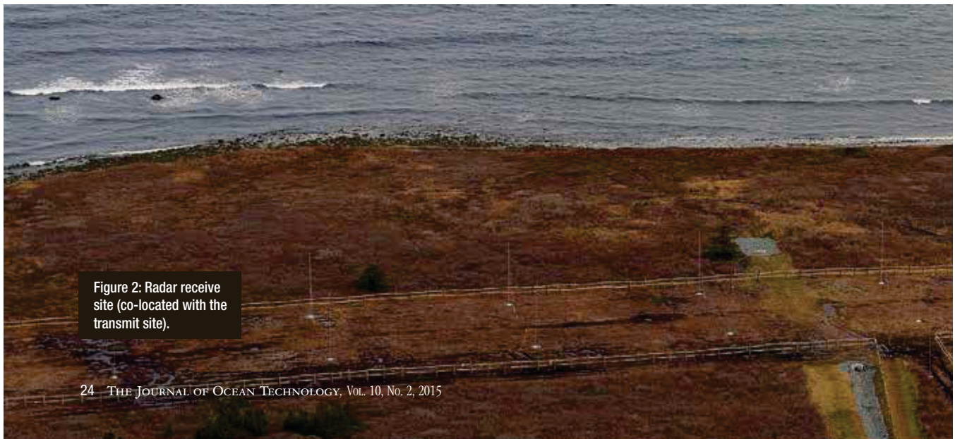
Figure 2: Radar receive site (co-located with the transmit site).

A solution to the problem of reducing the beam-width without increasing the physical length of the receive array was developed based on a multiple input multiple output like architecture used to generate a virtual aperture array (patent pending). The technique generates narrower receive beams that reduce the physical area of the radar resolution cell and therefore improves the detection range of smaller vessels. Conversely the technique can