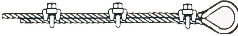
Figure 1: Schematic illustration of how the Crosby® clips fasten the ends of the crane cable.