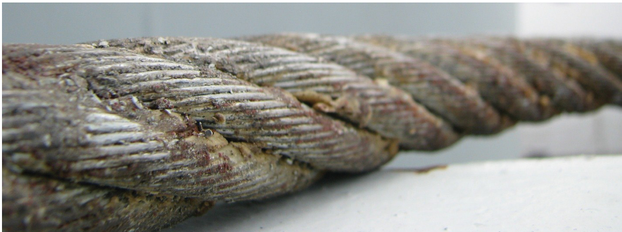
Figure 4: Example of mild corrosion on the cable.

An in-situ visual inspection was conducted on the section of the cable involved with the failure. Certain features on the cable, such as broken strands or wear, could indicate the cause of the failure [Ref C]. The inspection was conducted to see if there were any signs of corrosion, wear, broken strands or strand protrusions that would indicate the cause of the failure. The cable appeared to be in good shape: No strands were broken or protruded; wear and corrosion were minimal. Figure 4 shows section of the cable with the most corrosion. It can be seen that the corrosion is minimal, and has not caused any of the exterior strands to fracture.