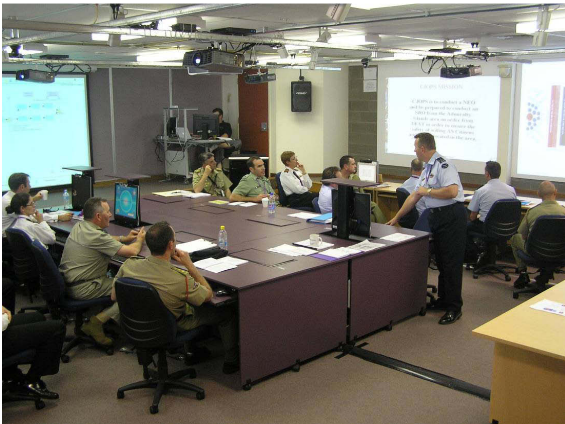
Figure 4: One of the 10 federated LiveSpaces in use at the Australian Defence Force Warfare Centre

Figure 4 shows a LiveSpaces environment in use at the Australian Defence Force Warfare Centre. In this case, in addition to having access to their own personal displays, the users have access to a range of shared displays including LGDs and a number of smaller displays used to provide ambient information and for activities such as video teleconferencing. The underlying LiveSpaces infrastructure supports various ways of managing, controlling, and interacting with the shared displays. For example, the LiveSpaces automation system can allow autonomous control of the displays to rapidly configure the displays with required information for the task at hand. A LiveSpaces application called Ignite can be used to reconfigure displays, either from a touch screen located near the front door or from individuals' workstations. Individuals can interact with the shared displays by simply moving the mouse cursor from their own screen onto the shared screens. Users can also easily share the information on their own screens with others. The LiveSpaces infrastructure supports the federation of sets of LiveSpace environments to provide support for distributed collaborative work.