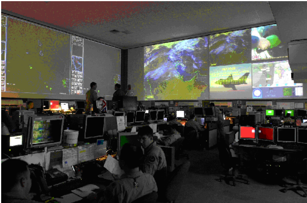
Figure 1: An example of the use of Large Group Displays for C2

area and so can be used to display a range of additional and related information. Figure 1 shows an example of how LGDs are being used in modern C2 centres, in this case at the Prince Sultan Air Base Air Operating Center. In this example, multiple LGDs are being used to provide a range of information about the operational setting including the operating picture, video feeds from airborne assets and the provision of weather conditions in the area of interest.