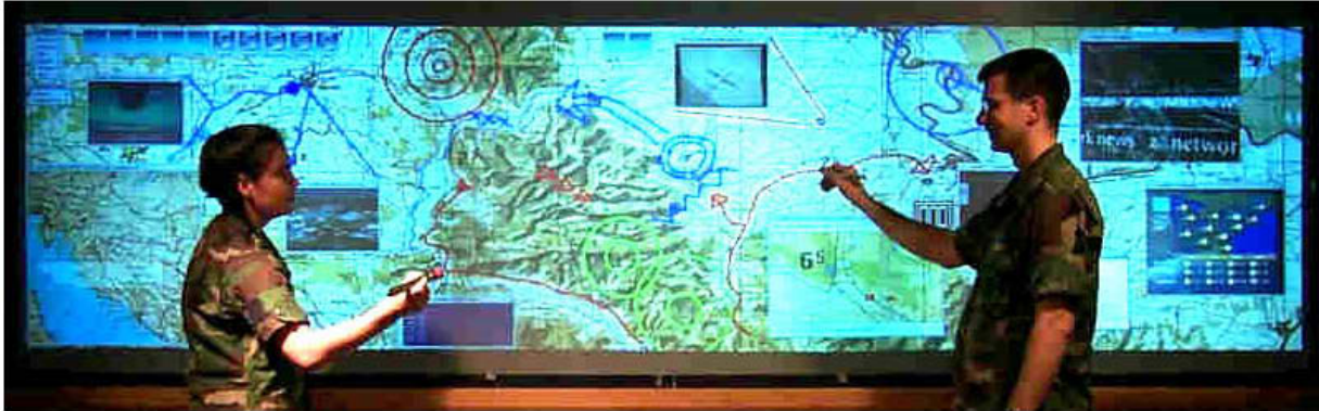
Figure 3: The Interactive DataWall

interaction through speaker-independent voice activation and a wireless pointing device using camera tracked laser pointers. The system provides both conventional computer mouse functionality and electronic grease pencil capability to interact with a high-resolution display. Three horizontally tiled video projectors allow a combined resolution of 3840 x 1024 pixels across a 12' x 3' screen area. Examples of data display elements include detailed terrain, land route maps, real-time audio/video communications, airborne surveillance and intelligence information, archived geographic database information, and modeling and simulation capability for sortie generation exercises (Jedrysik et al, 1999).